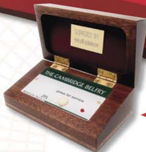
◀ Executive box in range of wood and finishes