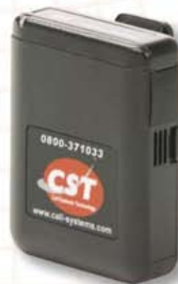
▶ Alphanumeric pager