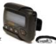
With holster & safety cord